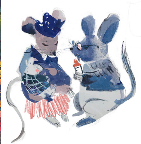
JILL GRINBERG LITERARY MANAGEMENT